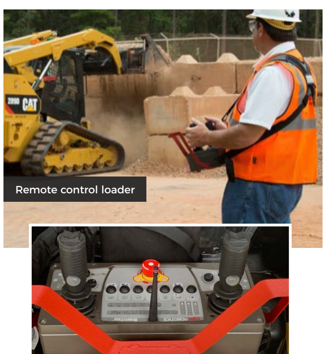
THIS IS THE ONLY SOLUTION WITH ONLINE CAPABILITY AND NON-ENTRY SAFETY